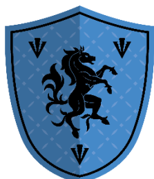
EGERTON HOUSE ALL FOR ONE

At the end of each term, a school postcard is awarded to the child from each House who has achieved the highest total number of housepoints that term.