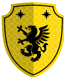
ELLESMERE HOUSE ANYTHING IS POSSIBLE